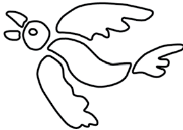
Bird • $750 Approximately 10" x 10"