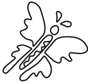
Butterfly • $500 Approximately 7" x 7"