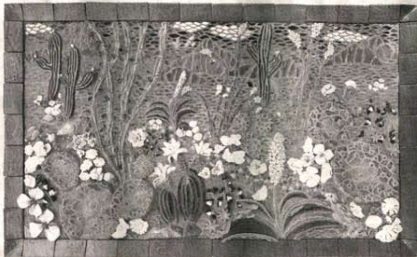
"Sonoran Desert", 44" X 72", residential commission, Oro Valley, Az, 2008