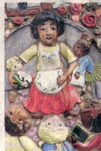
The walls are part of a $646,610 revitalization project.

growth on the periphery, the older neighborhoods suffer, and these projects are the county's way of starting to put a stop to that."