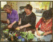
Page 10 Green Grannies and Kitchen Gardens