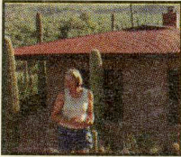
Page 9 Rammed Earth Home Building