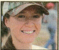
Page 11 Guiding Light of Catching Water