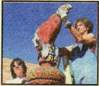
Page 3 Artist of joy