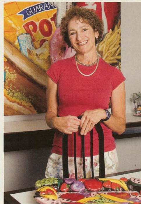
ABOVE The artist poses by her first work, an acrylic painting. On the table is one of her later tile works.

"We said, 'Let's have an adventure,'" and Tucson was the first and last stop," she laughs. ▶